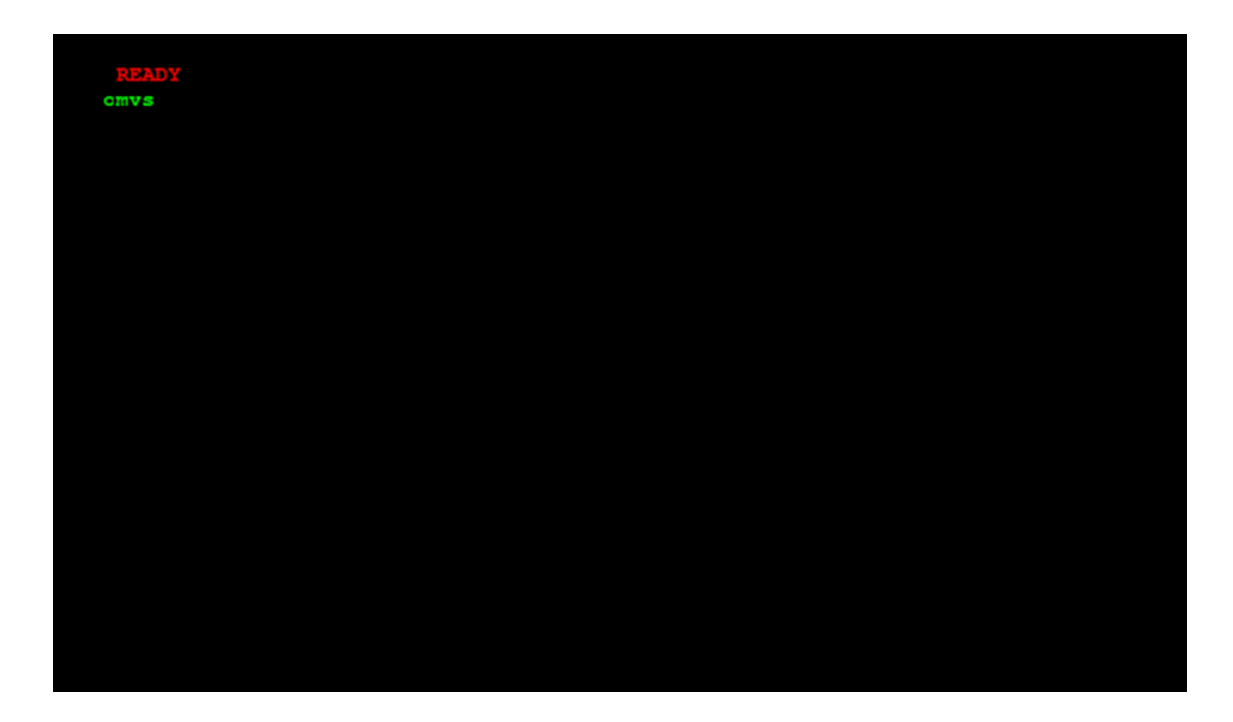
Figure A.3. Entering OMVS

You are now in USS (UNIX for z/OS). Take note of the numbers and commands at the bottom of the screen. They are commands that can be executed via the corresponding Function keys. F6 (TSO) is of particular interest. With this key you can type in TSO commands such as ISPF 3.4 and press F6 (do not press Enter after it) to run the TSO command.